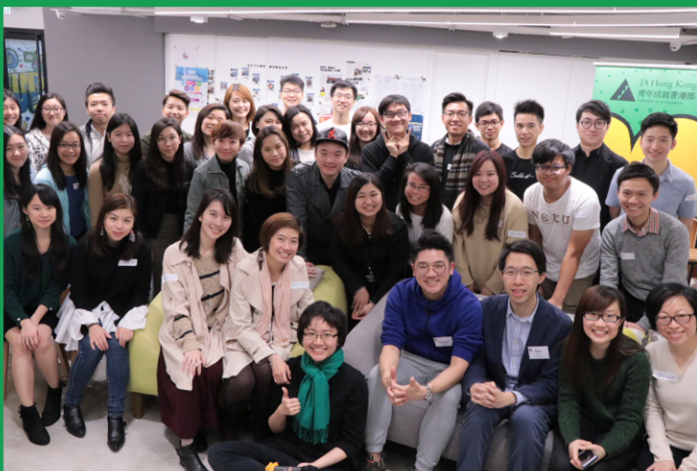
40 JA buddies joined JA Hong Kong Alumni Kick-off ceremony - Hoi Sem Gala