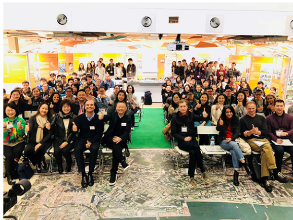
Program kick-off event - group photo

Riding on the successful partnership with J.P. Morgan in creating pathways to employment for youth in Indonesia and Malaysia, JA Asia Pacific is proud to extend the partnership through the implementation of the School Challenge program by JA Hong Kong.