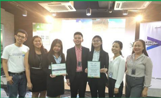
Students team up from Japan, Singapore, and the Philippines

Students from Japan, Philippines, and Singapore team up and emerged as winners in the Travel and Tourism Business (TTBIZ) 2017 Competition.