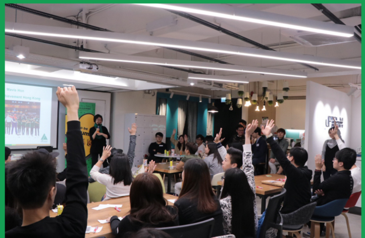
90% of JA buddies are alumni from JA Company Program