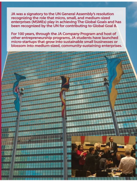
JA was a signatory to the UN General Assembly's resolution recognizing the role that micro, small, and medium-sized enterprises (MSMEs) play in achieving The Global Goals and has been recognized by the UN for contributing to Global Goal 8.