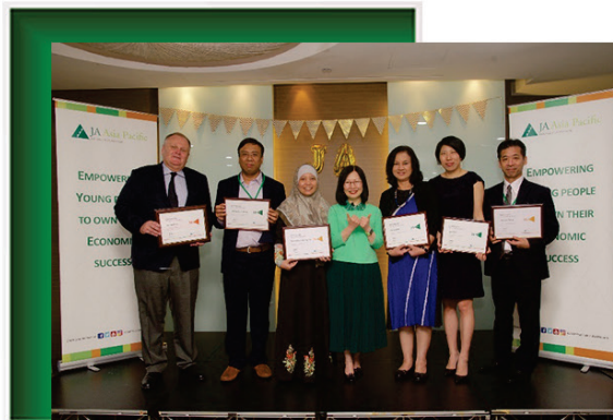
Long Service Awards recipients receiving their awards on site at the JA AP Awards Dinner

One of the major highlights of the 2018 JA AP Leadership Conference was the celebration and recognition of the outstanding leaders from the network at the JAAP Awards dinner in the evening of Day 1 . 270 year of services dedicated to the future of our youth in Asia Pacific was celebrated.