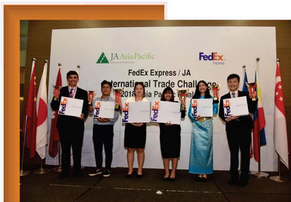
2018 ITC Asia Pacific Finals Winning teams From L to R: Team CoLab, 3rd place winner ; Team Ratoon, 2018 ITC 1st place winner; Team Teilah, 2nd place winner.

Congratulations to all the participants and winners of the 2018 FedEx Express/JA ITC Asia Pacific Finals!