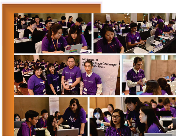
Workshop session guided by FedEx Facilitators before the competition day