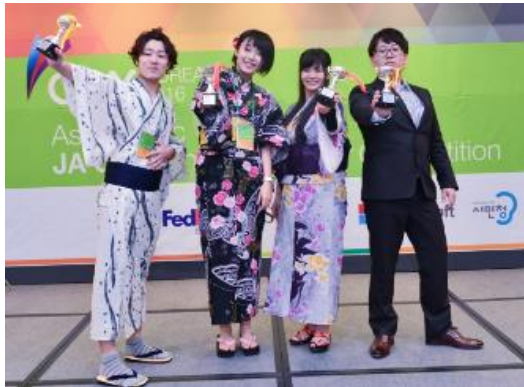
JA Company 'SYO' - 2016 JA AP COY 'Young Entrepreneurs' Choice Award winning team