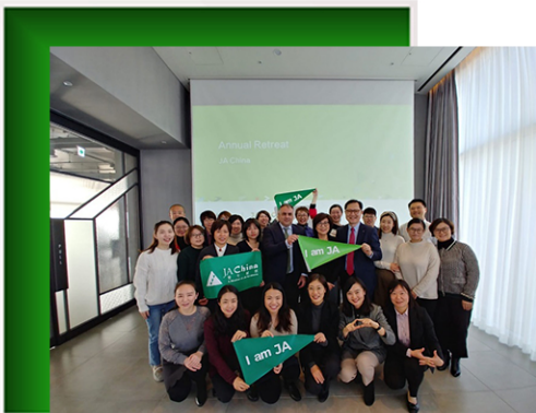
With JA China and JA Korea team at their cross-borders workshop in Seoul