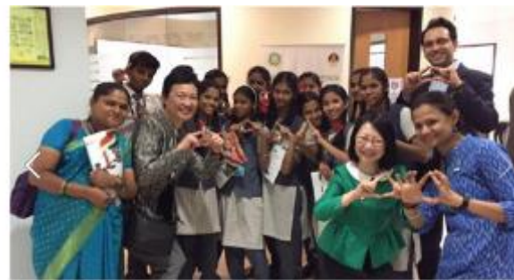
Thanks to our JA India Team for activating employment opportunities for our youth. An incredible Indian Immersion journey!