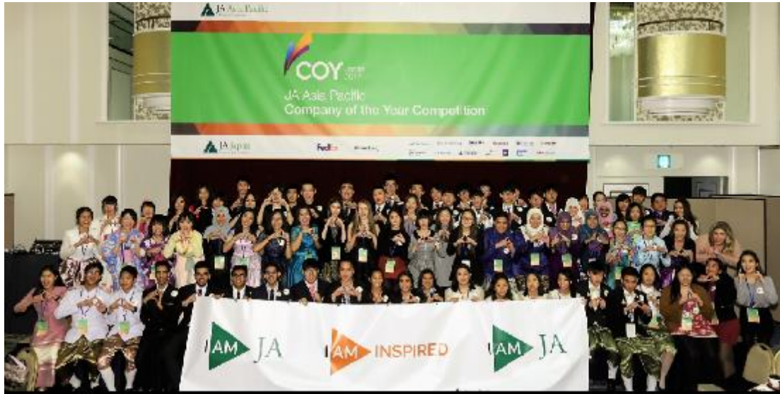
2017 JA AP COY participants in the first ever "I am JA" Graduation moment at the JA AP COY Awards Dinner

The 7th JA AP COY was successfully held from Feb 19 to 22, 2017 in Tokyo, Japan. The largest representation since the competition started in 2011, 76 students representing 19 student companies and 13 locations participated in this year's competitions. The 13 participating locations include: Brunei, China, Guam, Hong Kong, India, Indonesia, Japan, Kazakhstan, Korea, Malaysia, Philippines, Singapore, and Thailand.