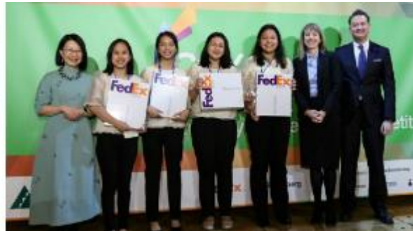
From L to R: Young Entrepreneurs' Choice Award: LovU, JA China; FedEx Access Award: Hiraya, JA Philippines