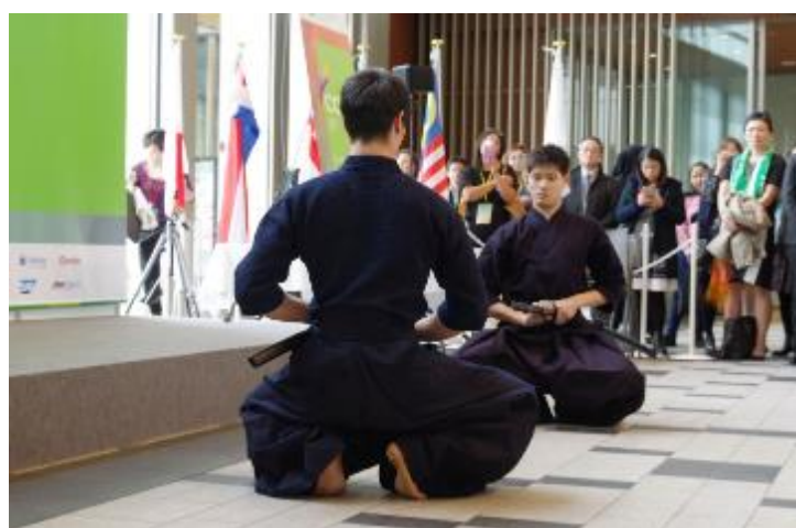
“Kendo” - A special traditional performance organized by JA Japan

To cheer for all the participating teams and to enhance the exposures for all students to the Japanese culture, a special traditional Japanese performance – “Kendo” was organized and brought to everyone before the Trade Fair officially opened.