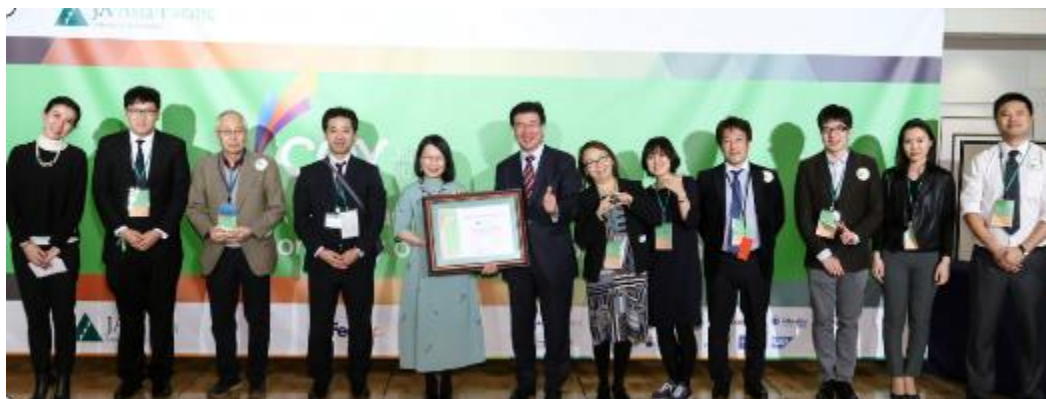
A special token of appreciation from JA Asia Pacific, organizer of JA AP COY to JA Japan, Host member of the 2017 JA AP COY