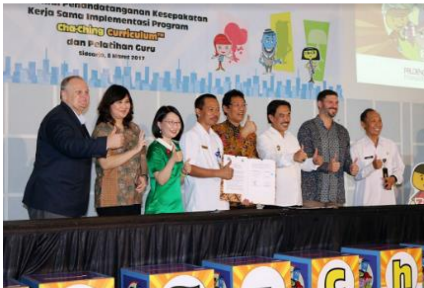
MOU signing ceremony officiated by representatives from the Education Ministry of Sidoarjo, Prudence Foundation, JA Asia Pacific, and PJI to have the Cha-Ching Curriculum implemented in the schools of Sidoarjo, Indonesia