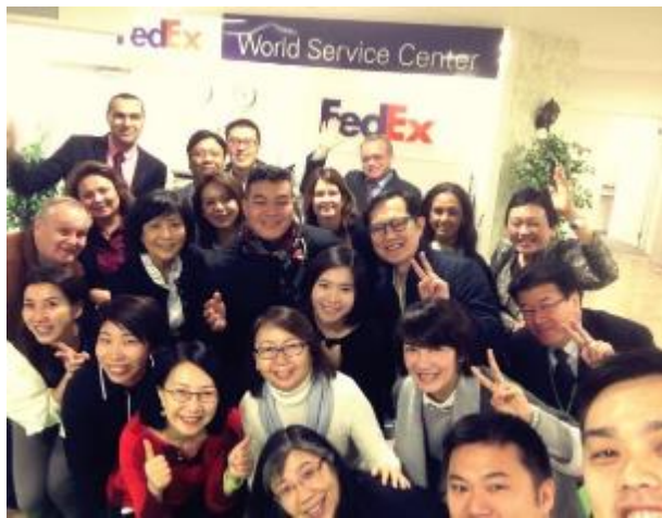
JA AP SLT meeting and tour at the Student City in Shinagawa, Tokyo